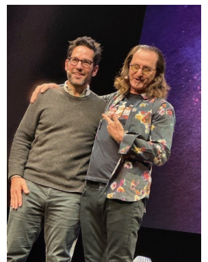
Paul Rudd and Geddy Lee