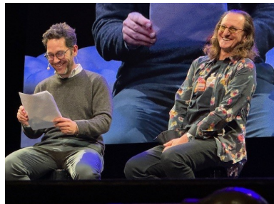
Paul Rudd and Geddy Lee