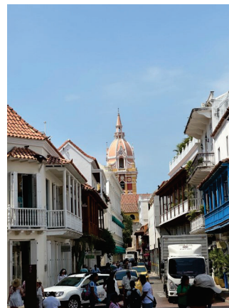
Belfry of the Cathedral of Cartagena

it is a town with cobblestone streets, colorful people wearing vibrant outfits that are native to the country, and I felt at most time generally safe. I must say like many countries of the region there were parts where we did not travel to visit, and that are likely quite unsafe, but overall we had a wonderful time.