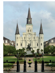
St. Louis Cathedral In Jackson Square

One of my favorite places for a quick getaway with girlfriends is New Orleans. We love the laid-back vibe of the Quarter with its amazing restaurants, bars, architecture and musicians. You can stroll the Quarter for hours and never get bored. We took this quick trip with no agenda, just some quality time to enjoy each others company.