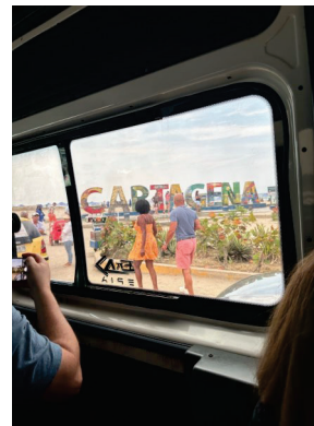
Arriving in Cartagena.

This wedding was between the son of my wife's closest friend and a young woman he was marrying from our area. They met in South Florida, and what I have come to learn, is that Cartagena has become a real hotspot for destination weddings in the last few years.