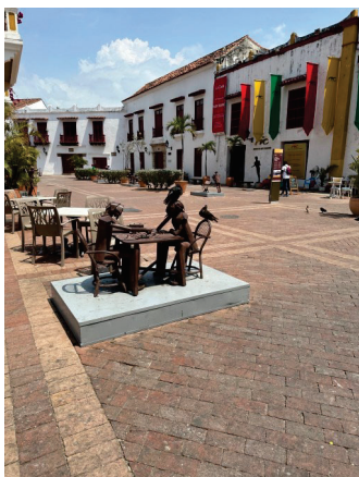
A Town Square.

The people there were very welcoming, the food was excellent, and the weather was warm (though it's a little on the humid side). The main attraction there is the old city, which was built several hundred years ago, and